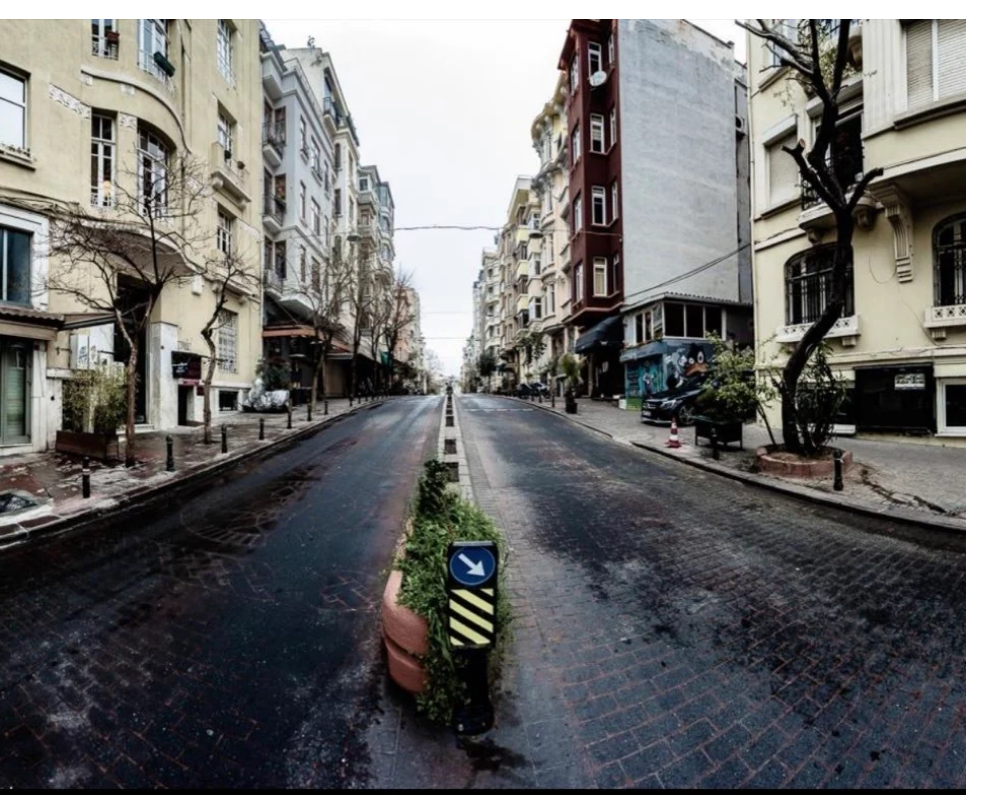
A street in Istanbul during the coronavirus lockdown in Turkey

Millions await to hear what will happen when the 17-day lockdown is set to end next week. Authorities are basing their plans on the number of daily COVID-19 cases. But the president has implied that a gradual lifting of the restrictions is in store.