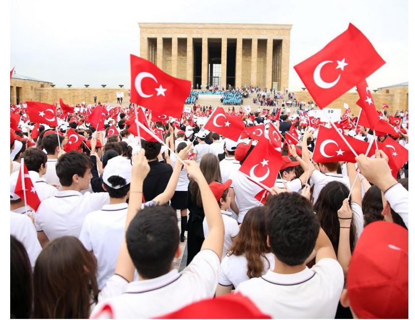
Anıtkabir, the Mausoleum of Mustafa Kemal Atatürk, Ankara

Turkey Will Celebrate the Commemoration of Atatürk, Youth and Sports Day on Wednesday, May 19th